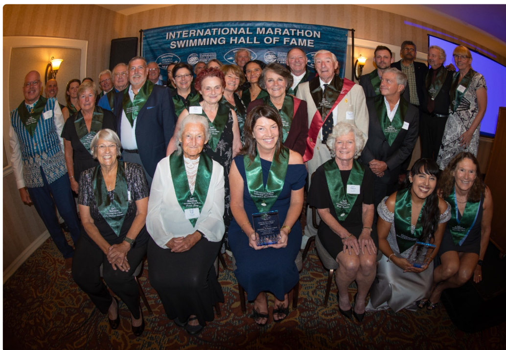
2026 HONOREES IN SAN DIEGO